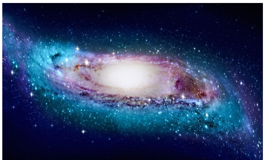
Artist's impression of the warped and twisted Milky Way disk.

But the pull of gravity becomes weaker far away from the Milky inner Way's regions. In the galaxy's outer disk, the hydrogen oms making up of the most Milky Way's gas disk are no longer confined to a thin plane, but they