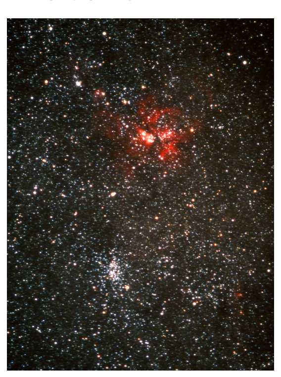
NGC 3372 The Eta Crinae Nebula

The speaker of the night will be Paul Borchardt. In his talk: "Haleakala: Surf to Sunset" Paul will tell a story of going from the base of the Maui mountain Haleakala to the top and taking astrophotos on the summit. The slideshow will include images of changing vegetation, views from the mountain, as well as several breathtaking astrophotos. One of those is a scan of the NGC 3372 The Eta Carinae Nebula shot with a 200 mm lens, 30 min exposure on ISO 100 color slide film.