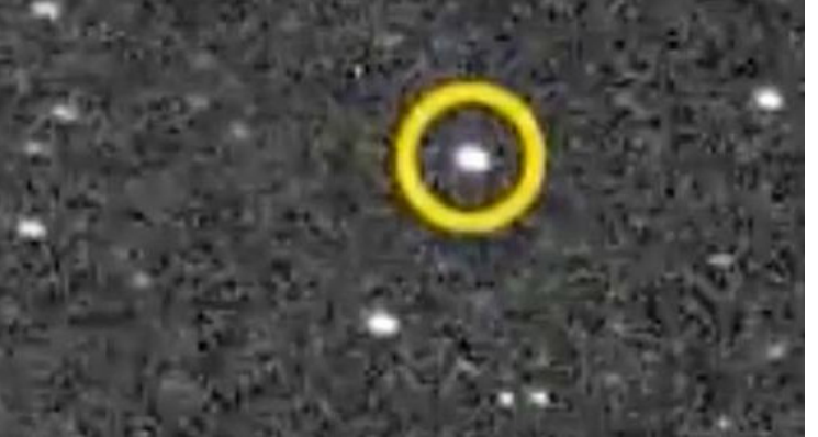
This image still from a video by scientists studying the black hole V404 Cygni located about 7,800 light-years from Earth shows visible light that could be viewable by stargazers with a medium-size telescope.

suggested the system's variable flickering was due to instabilities that can occur in accretion disks when they get very massive. However, the accretion rates at V404 Cygni are at least 10 times lower than those seen at other black hole systems that have similar oscillations. This suggests that high accretion rates are not the main factor behind this variable flickering.