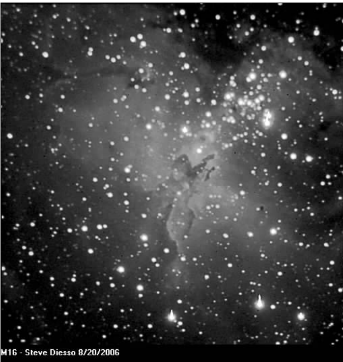
M16 - Steve Diesso 8/20/2006

As this picture by Steve Diesso attests, the auto-guider is now operational on the LX-200. Steve's shot is a stack of 10 3-minute exposures. So, if you are interested in learning how to use the equipment we have out on the hill, contact a key holder and make plans to come out some Saturday night (see back page for key holder details.)