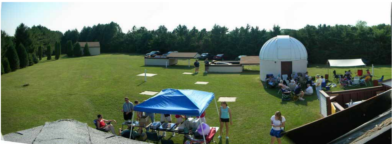
Picnic Photomontage

Scott shot 3 images out of the slit of A-Dome (A is for Armfield) with his Nikon Coolpix S1 and stitched them into the image above.