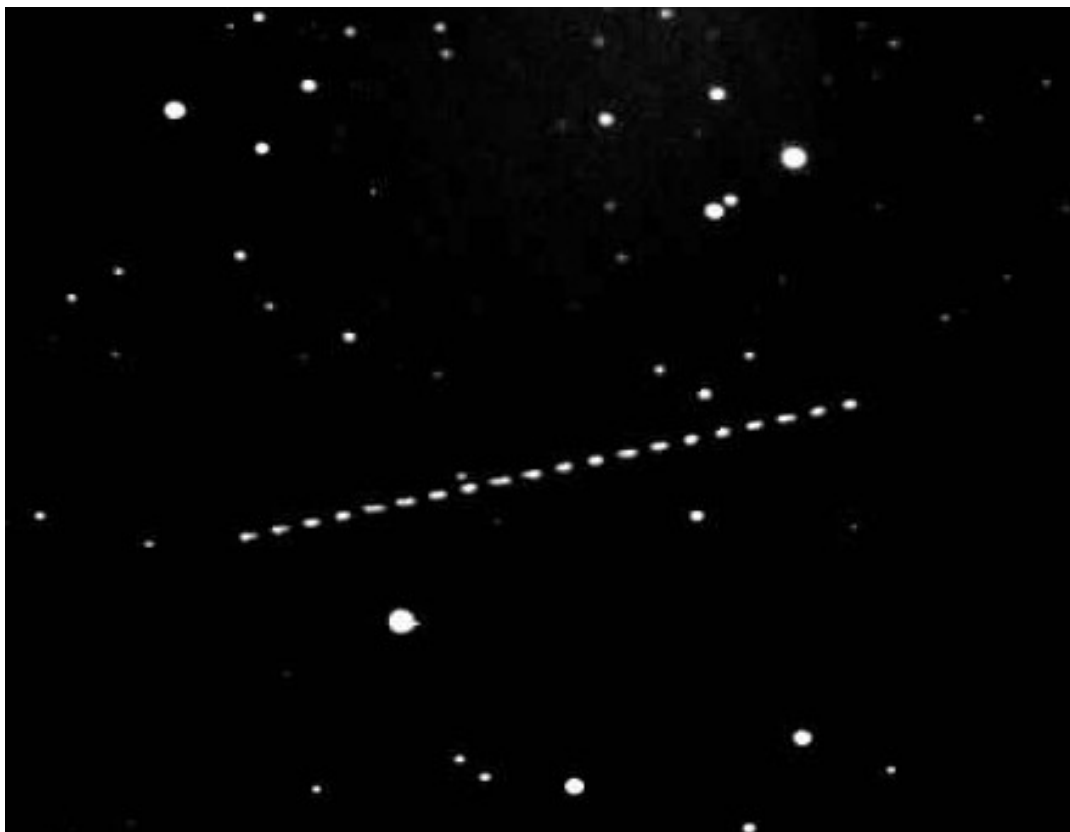
Multiple exposure CCD image of 1999KW Near earth asteroid. The photo is a composite of 20 successive images taken 2 minutes apart. This particular asteroid passed within three million miles of earth.