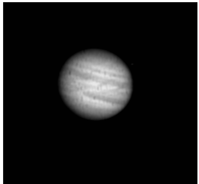
First images taken with the new Santa Barbara ST9 Imager. Top image show M42, Orion nebula centered on the Trapezium cluster of stars. Lower right is Saturn and lower left is Jupiter, all taken on the 25" Z scope and without eyepiece projection.