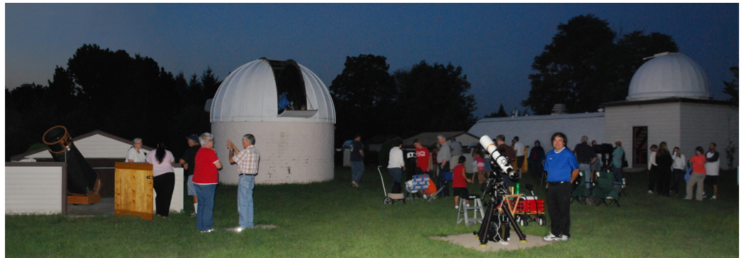
The view of the MAS Observatory after sunset during the preparation for the stargazing.

The fifth Public Observing Night was held with the record turnout (over 100 persons) under perfectly clear sky. Henry gave a slideshow presentation about the Milky Way. Later in the night the guests were able to observe thru variety of telescopes. We collected $170 from parking fee ($5/car) for the MAS. The sixth public observing night is scheduled for September 23 th at 7:30PM at the MAS