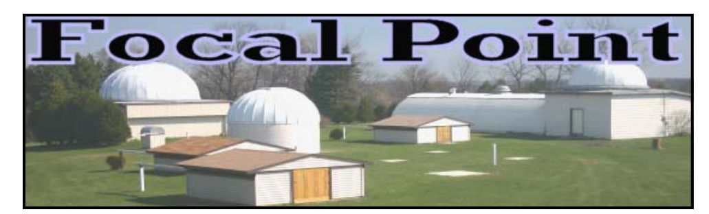
Newsletter of the Milwaukee Astronomical Society