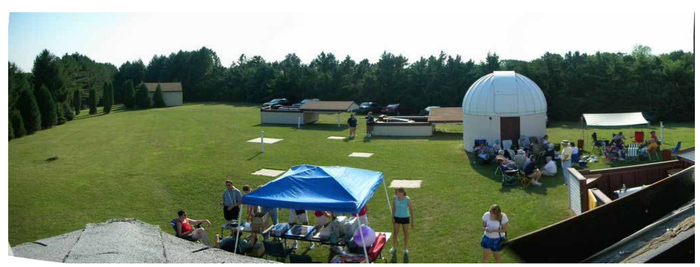
Picnic Photomontage credit Scott Berg

Scott shot 3 images out of the slit of A-Dome (A is for Armfield) with his Nikon Coolpix S1 and stitched them into the image above.