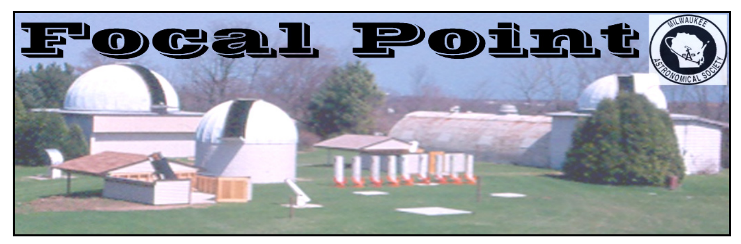
The Newsletter of the Milwaukee Astronomical Society