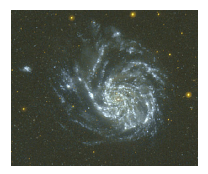
This image of Messier 101 (M101), a.k.a. the "Pinwheel Galaxy," was taken in two orbits of GALEX on June 20, 2003. M101 is 20 million light years away.

This article was provided by the Jet Propulsion Laboratory, California Institute of Technology, under a contract with the National Aeronautics and Space Administration.