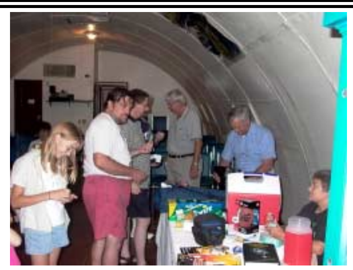
Members signing up and checking out the great door prizes given by our generous sponsers this year.

As always our sponsors played a big part in our door prizes. I'd like to thank Anacortes Telescope and Wild Bird, Astronomy Magazine, Jim's Mobil, Meade Instruments, Orion Telescope and Binocular, Sky & Telescope