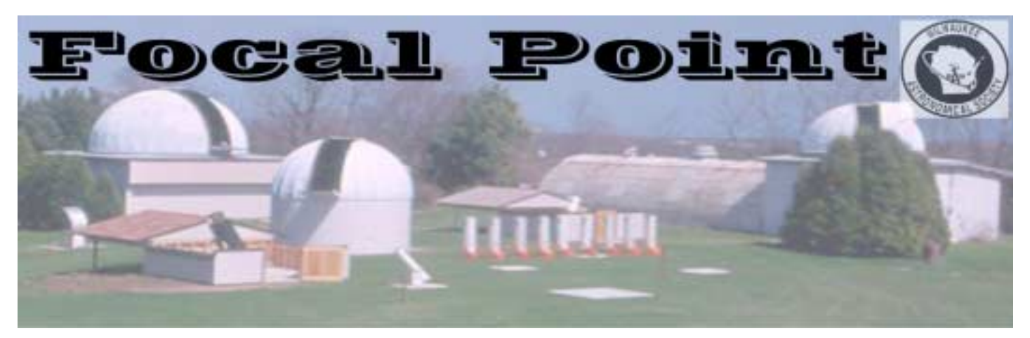
The Newsletter of the Milwaukee Astronomical Society