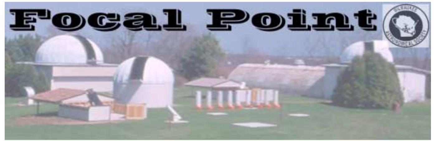
The Newsletter of the Milwaukee Astronomical Society