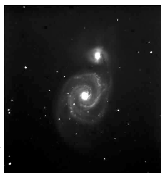
MAS Picnic By Vern Hoag

This is a picture of M51 with a total of 60 seconds exposure. Tests will be continuing this month to see how faint we can go with this setup.