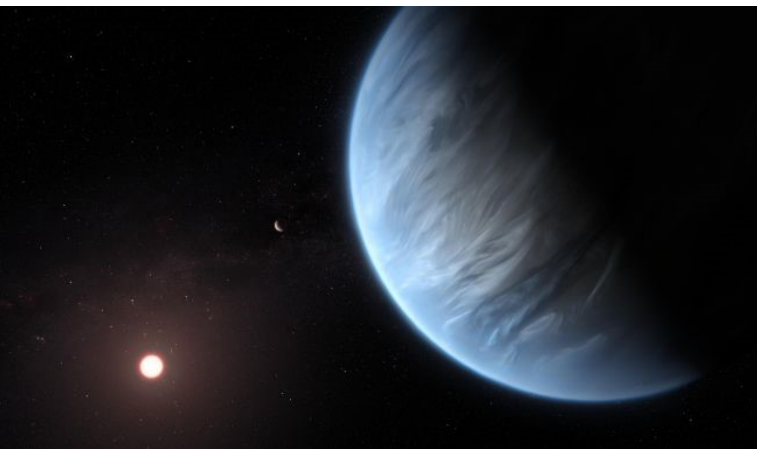
as Artist's impression of planet K2-18b, its host star and an accompanying planet.

used to here on Earth. The planet's temperature is also uncertain. Tsiaras' team estimated a surface temperature of between minus 100 and 116 degrees Fahrenheit (minus 73 to 47 degrees Celsius). K2-18 b's gravitational pull is better understood, because we know the planet's mass and diameter. If most of the exoplanet is solid rock and ice, a visitor to the world's surface would feel 37% heavier than he or she feels on Earth. (K2-18 b's higher mass is mostly offset by its greater size in this regard, because the gravitational force decreases with the square of the distance from a planet's center.)